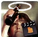
Halos (All Kids Face this Issue)