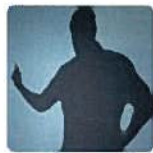
Basement (Espanol) (Parental Influences)