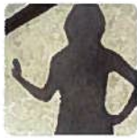
Curbside (Parental Influences)