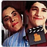
Keep on Them (Parenting Skill)