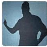
Basement (Parental Influences)