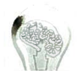
Light Bulb (Brain Damage)