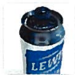
Beer Can (Espanol) (Parents are Key to Prevention)