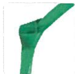
Straw (Espanol) (Parents are Key to Prevention)