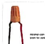
Wired (Espanol) (Brain Damage)