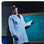
P.H.Dad (Espanol) (Parental Skill)