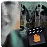
Interference (Espanol) (Brain Damage)