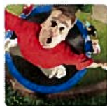
Do Dad (Parental Influence)