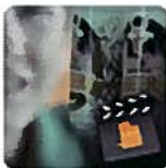
Interference (Brain Damage)