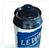
Beer Can (Parents are Key to Prevention)