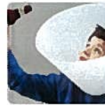
Kid Collar (Parental Skill)