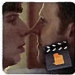
Close (Parenting Skill)