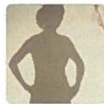
Slumber Party (Espanol) (Parental Influences)