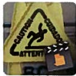
Now You Tell Me (Parenting Skill)