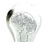
Light Bulb (Espanol) (Brain Damage)