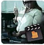
Stay In Contact (Parenting Skill)