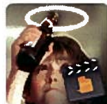
Halos (Espanol) (All Kids Face this Issue)