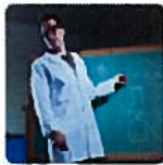
P.H.Dad (Parental Skill)