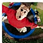
Do Dad (Espanol) (Parental Influence)