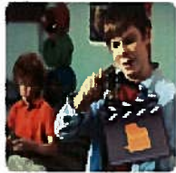
Genie (Parenting Skill)