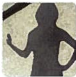
Curbside (Espanol) (Parental Influences)