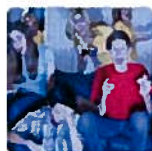
Omni Mom (Espanol) (Parental Influence)