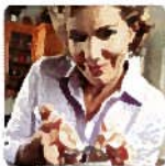
Mother Thumbs (Espanol) (Parental Influence)