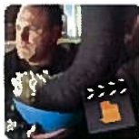
Elephant (Parents Ignoring the Problem)