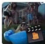
Oiled Up (Parenting Skill)