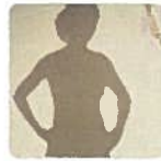
Slumber Party (Parental Influences)