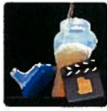
Cups (Espanol) (Brain Damage)