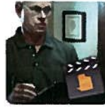
Know Your Child's Friends (Parenting Skill)