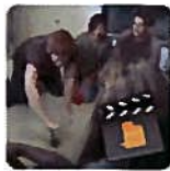
Spin the Bottle (Parenting Skill)