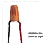
Wired (Brain Damage)