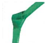
Straw (Parents are Key to Prevention)