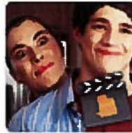
Keep on Them (Espanol) (Parenting Skill)