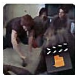
Spin the Bottle (Espanol) (Parenting Skill)