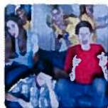
Omni Mom (Parental Influence)