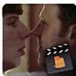
Close (Espanol) (Parenting Skill)