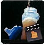
Cups (Brain Damage)