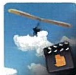
Hang Glider (Parenting Skill)