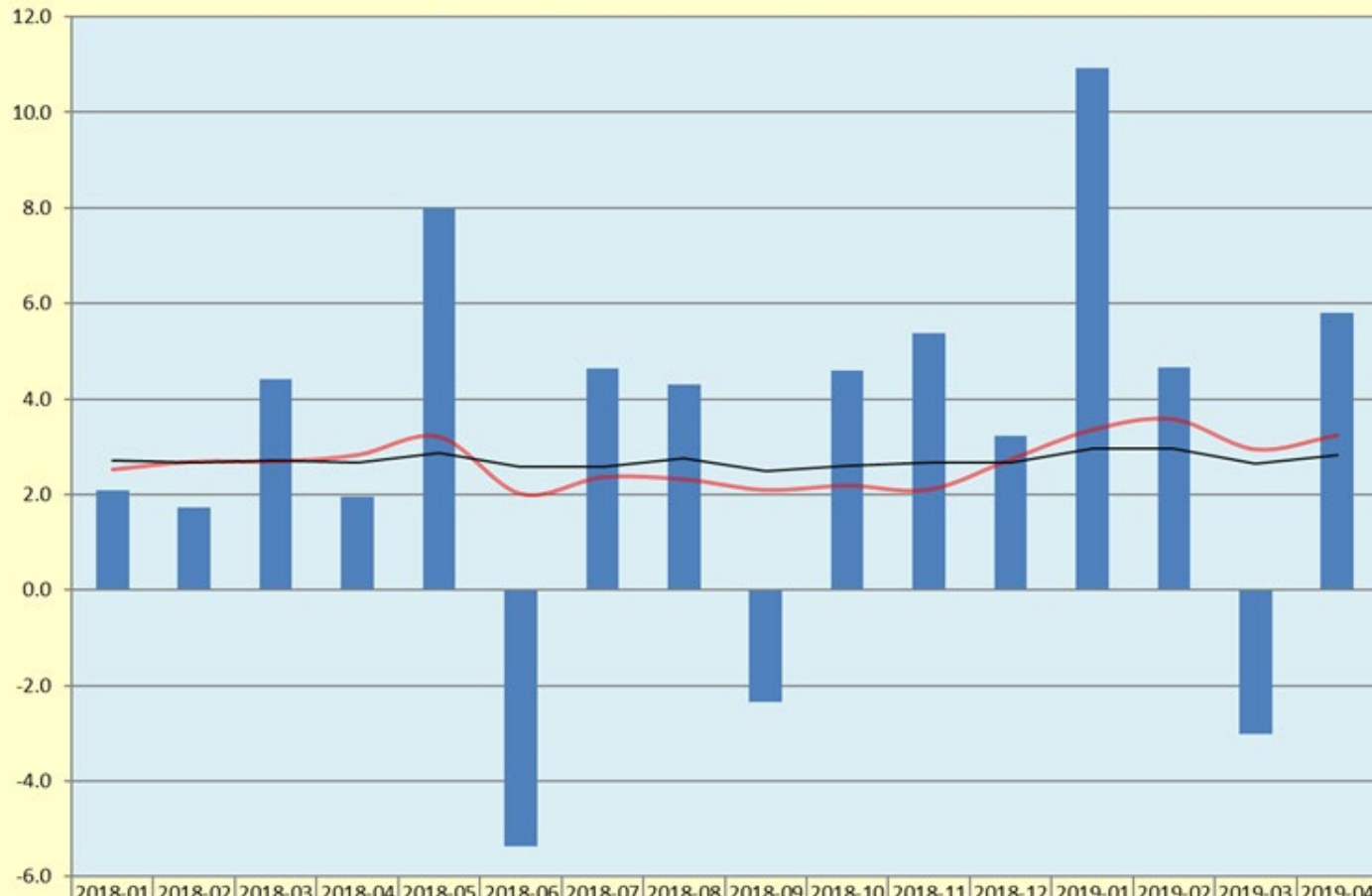
9 Liter Case Spirits Growth in the Control States as of April, 2019: Month over Same Month Last Year % Change, Rolling-12 Month % Change, and 3 Year CAGR