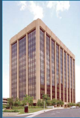
NABCA's Current HQ, on Ford Avenue in Alexandria, VA

2006: Headquarters moved to current location, 4401 Ford Avenue, Alexandria, VA