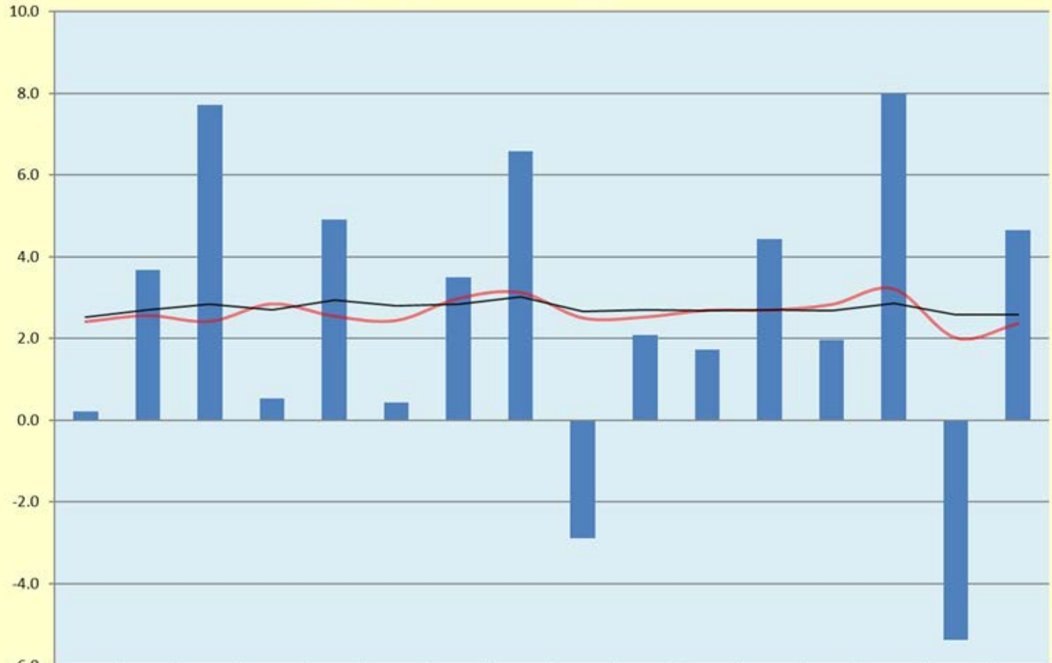
9 Liter Case Spirits Growth in the Control States as of July, 2018: Month over Same Month Last Year % Change, Rolling-12 Month % Change, and 3 Year CAGR